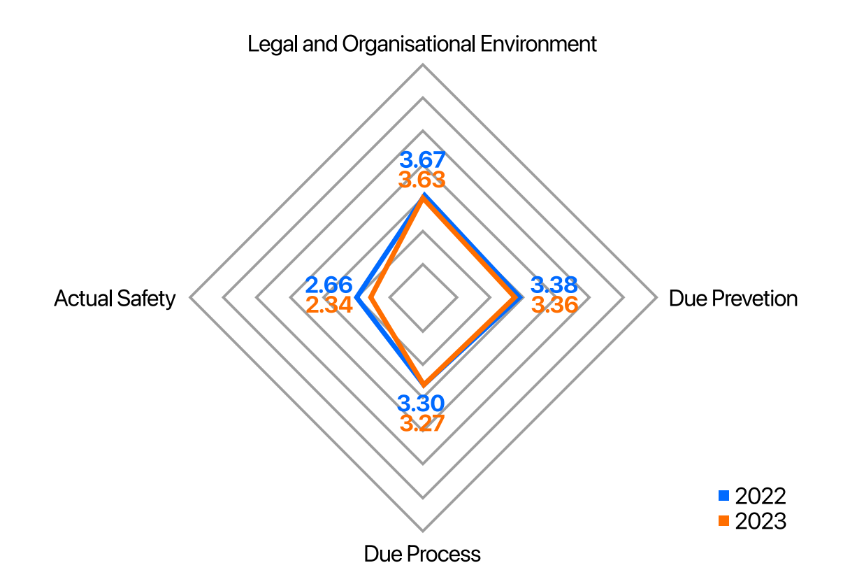
Journalists' Safety Index Kosovo – 2023